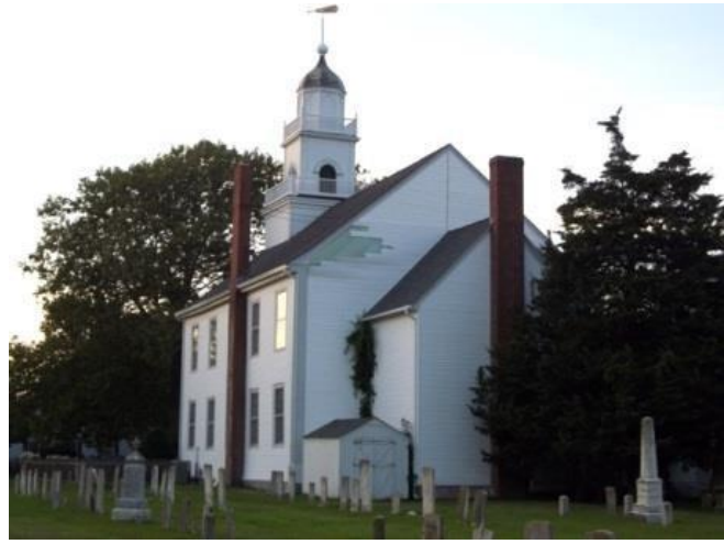
Old Burying Ground of the First Presbyterian Church