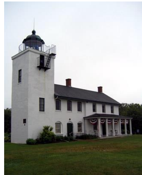
The Horton Point Lighthouse