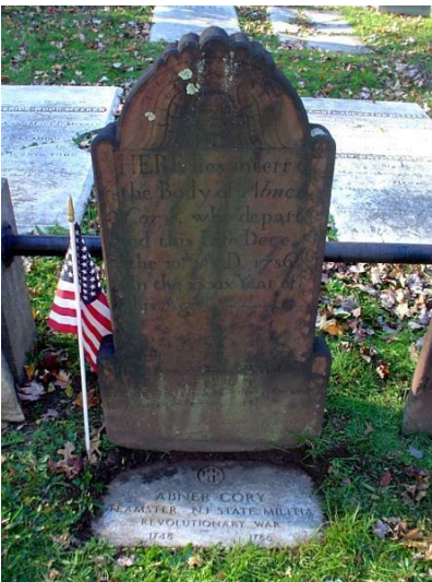
Abner Cory's grave in Rahway Cemetery, Rahway, New Jersey