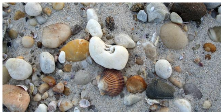
Seashells on Shelter Island Sound