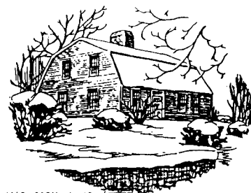
CHASE - CORY HOUSE C. 1730