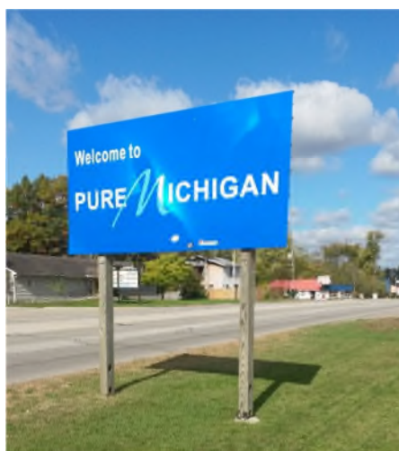
Michigan Welcome Sign near Niles, MI.