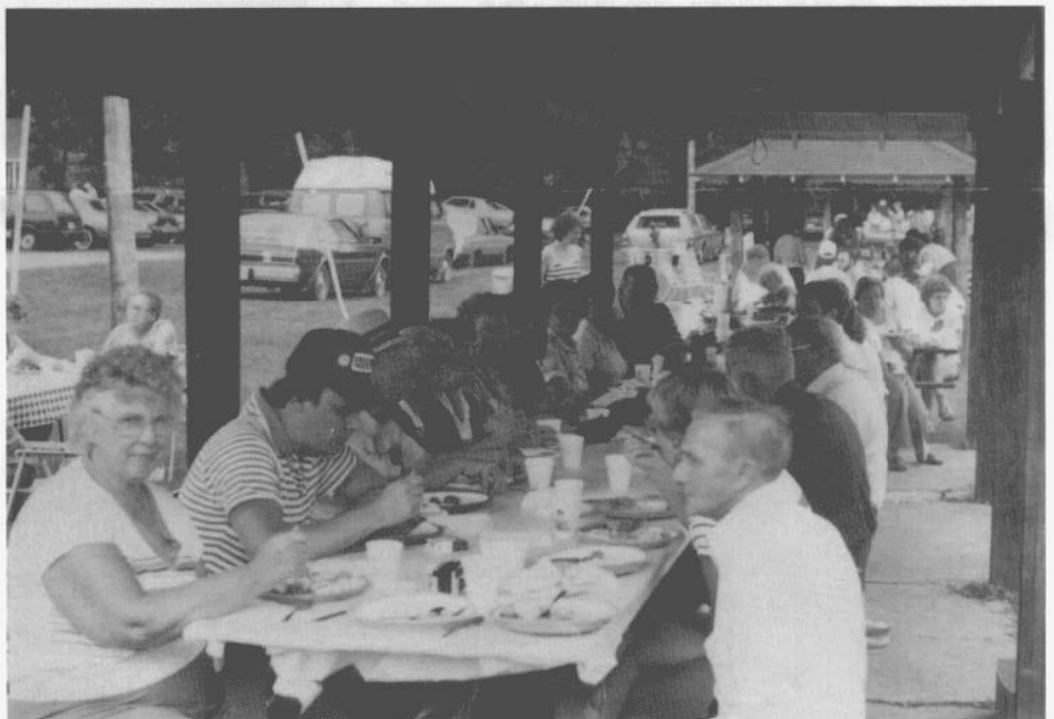
SOME OF THE CORY FAMILY AT THE REUNION IN OHIO AT THE PICNIC

YOU ARE CORDIALLY INVITED TO ATTEND THIS YEAR'S 77th CONSECUTIVE CORY FAMILY REUNION ON SUNDAY, AUGUST 17th, AT THE EAST PALESTINE, OHIO, VILLAGE PARK, ABOUT 1:00 P.M. COME FOR A GREAT GET TOGETHER OF AS MANY CORYS AS WE CAN!