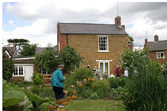
Fernville—Built AD 1435

We were shown many old homes, built or occupied by Cory families, including Fernville, more than five hundred years old. All the houses continue to be occupied, and have been lovingly restored and maintained. They all have beautiful flower gardens, as do nearly all homes in the village.