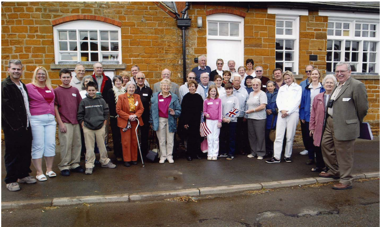
Cory Family Society Members in Harpole

The Cory Family Web pages www.coryfamsoc.com(US)