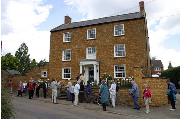
Richard Cory Manor---Built AD 1731

Harpole families do not replace old homes with totally new structures. They restore old homes as needed, and they spend an incredible amount of time and loving care with their flower gardens. The result is a charming and interesting village.