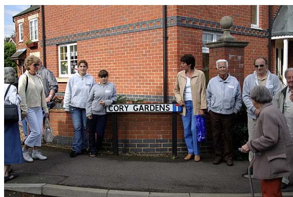
Cory Descendants in Harpole