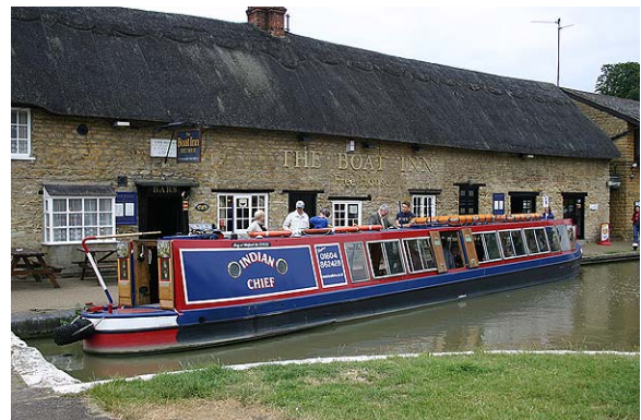
Boarding the Canal Barge